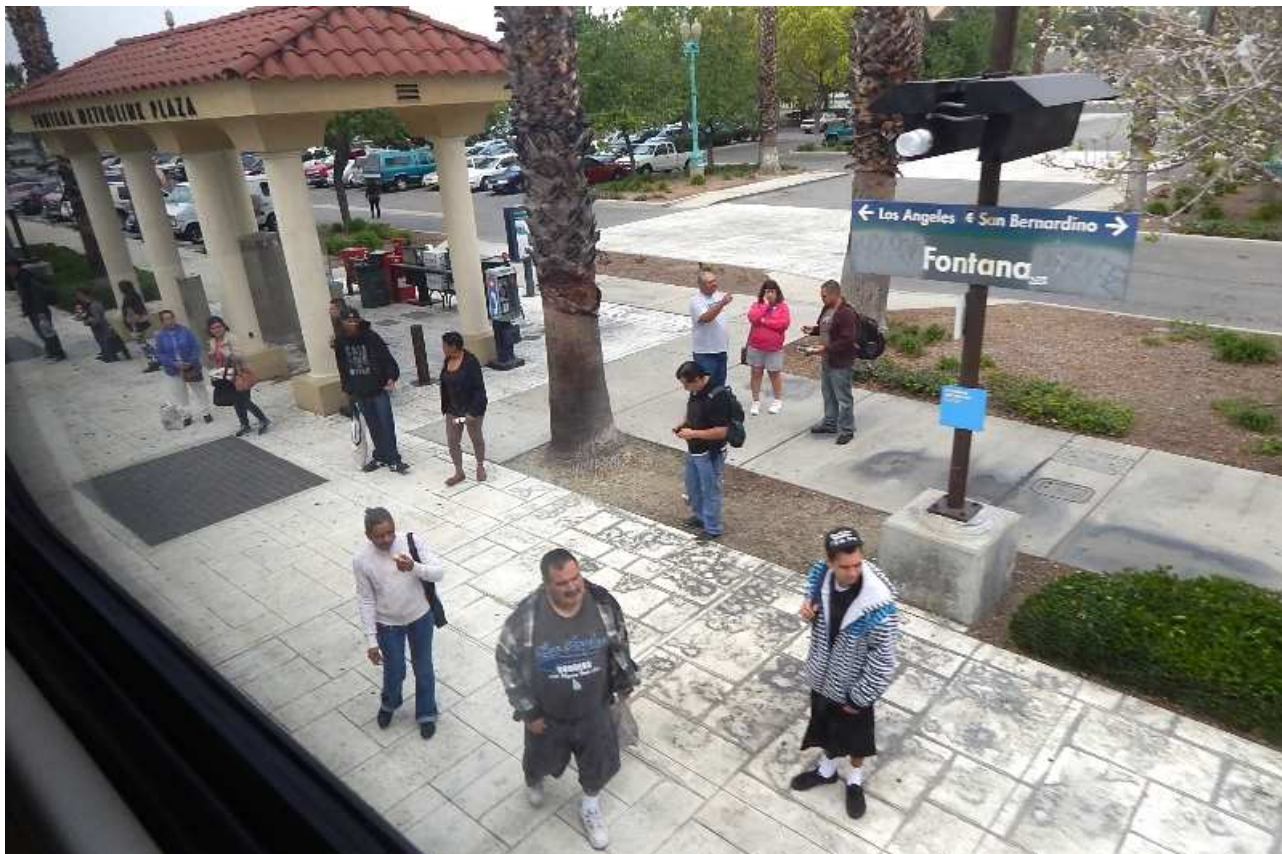
Passenger waiting to board Metrolink at Fontana going west mid-day in March 2014.

Opinions expressed in this newsletter are those of the authors and not necessarily those of the Rail Passenger Association of California.