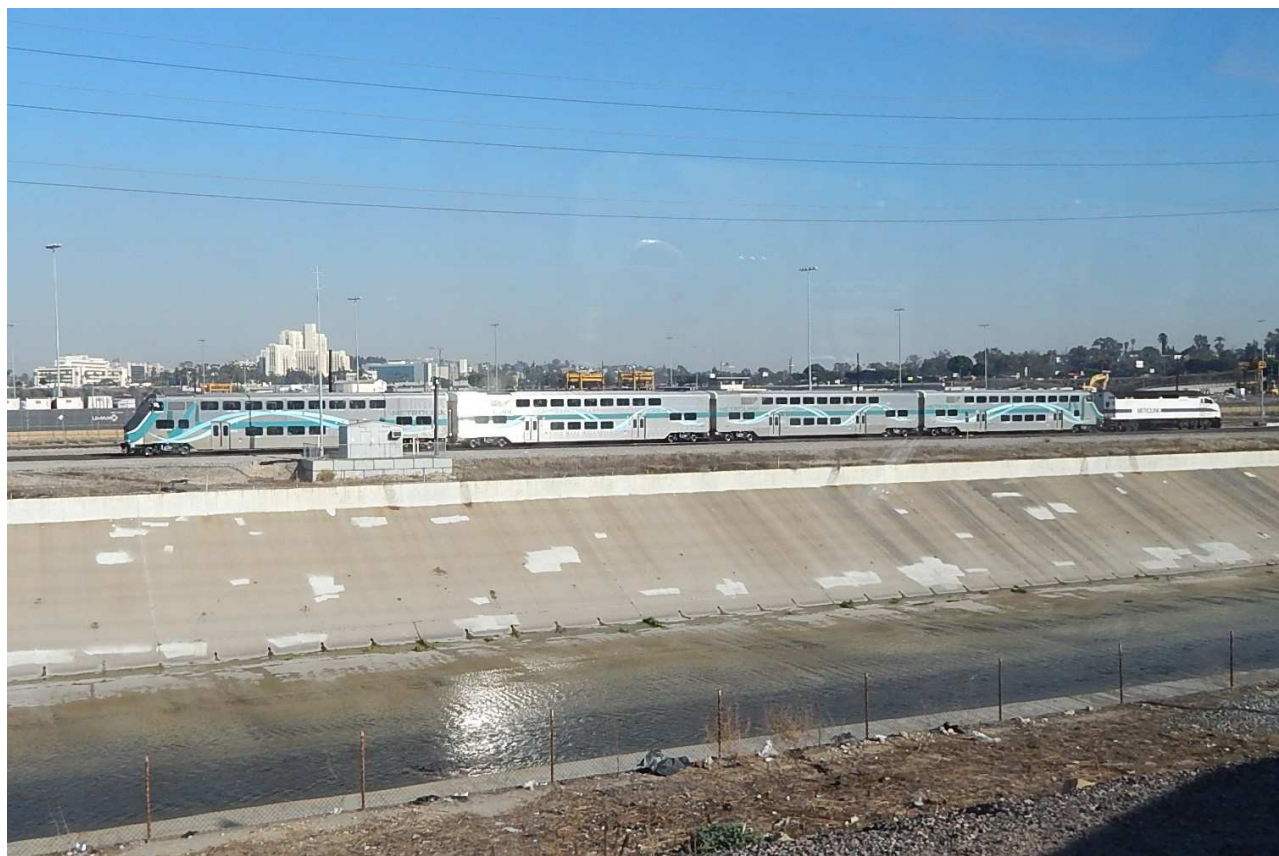
The view by the Los Angeles River from Metrolink train 602 from Union Station to Oceanside of train 316 to San Bernardino on a February afternoon.