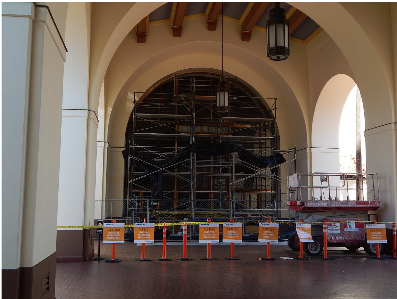
One of the many remodeling and restorations projects going on now at Los Angeles Union Station.