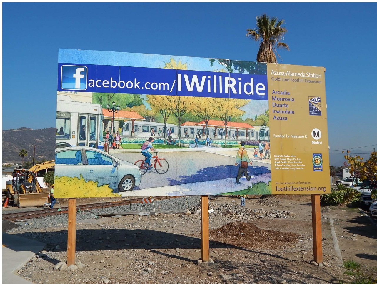
Sign at the construction site for the downtown Azusa station for the Gold Line extension from Pasadena deeper into the San Gabriel Valley. Under construction since the summer of 2011, it is now over half finished and will be in service by 2016.. Photo by Noel T. Braymer