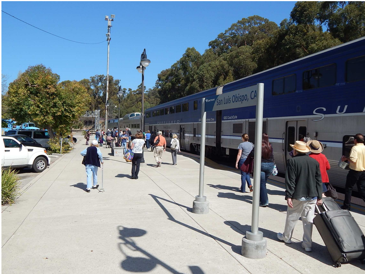
The Pacific Surfliner at San Luis Obispo in October 2013.

Bombardier provides operations and maintenance services to transit systems across North America, including AMT (Agence Metropolitaine de Transport) in Montreal, GO Transit in Toronto, MARC (Maryland Area Regional Commuter), MBTA (Massachusetts Bay Transportation Authority) New Jersey Transit, NCTD (North County Transit District) in California, OC Transpo in Ottawa, SFRTA (South Florida Regional Transit Authority), SCRRA (Southern California Regional Rail Authority), and, beginning in the spring of 2014, Central Florida Commuter Rail Transit (SunRail). Bombardier also supports transit systems with overhaul and refurbishment programs and material and technology solutions.