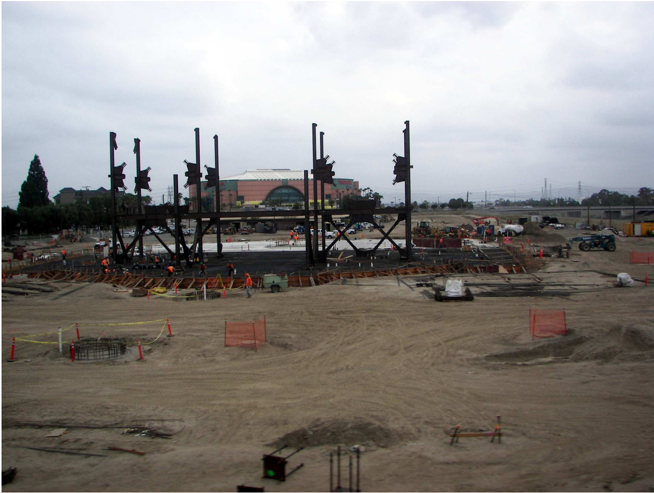
A recent view of construction of the new ARTIC Station in Anaheim expected to opened by late 2014. The building in the background is the Honda Center, a 18,000 person capacity arena also known as the Duck Pond for the Anaheim Ducks Hockey Team. ARTIC will serve with rail and local bus service the Honda Center, Anaheim Stadium and have connections to nearby Disneyland.