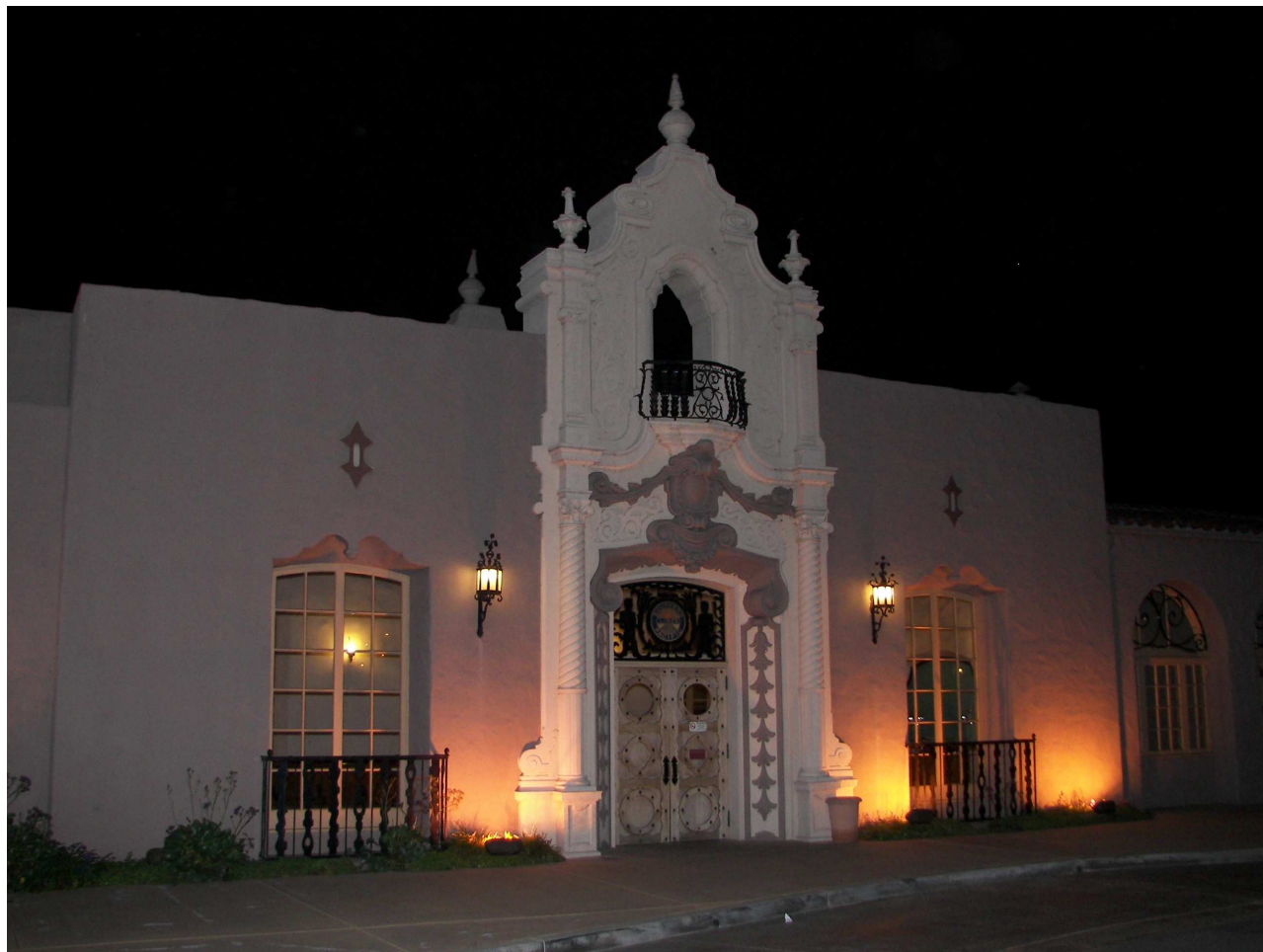
The historic Glendale, California train station at night.