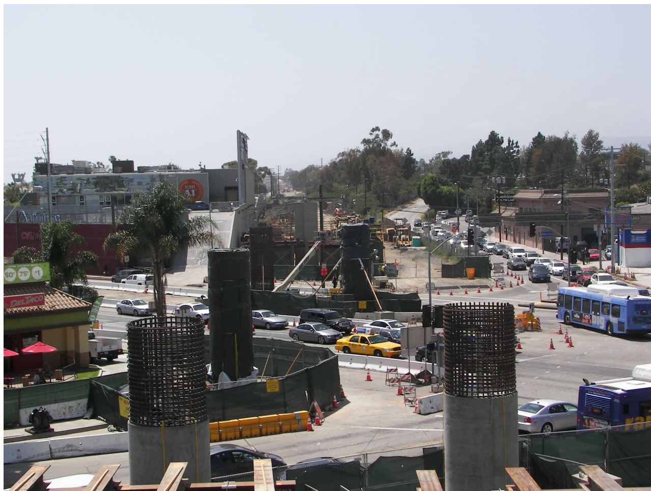
A recent view from the current end of the line for the Expo Line at Culver City. This is construction at Venice Blvd for the extension of the Expo Line to Santa Monica by 2016.