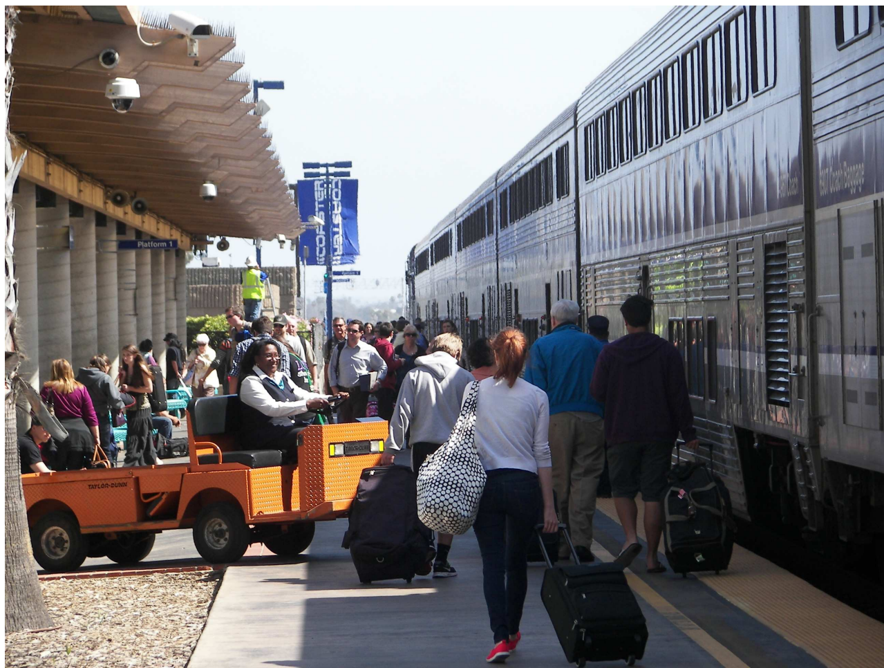
A typical Surfliner stop in the early afternoon at Oceanside.