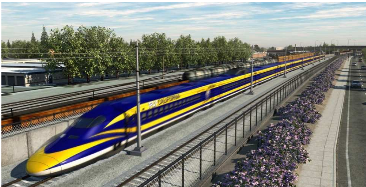
A drawing of how High Speed Rail service in Fresno near Shaw Avenue might look.