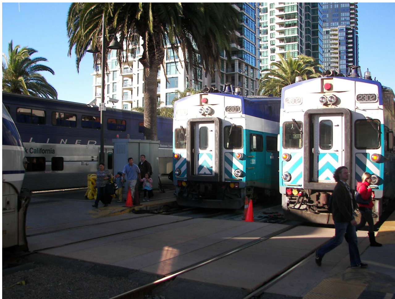
This is one of two busy crossings between the platforms at the busy San Diego Depot with Amtrak, Coaster and San Diego Trolley at downtown San Diego.